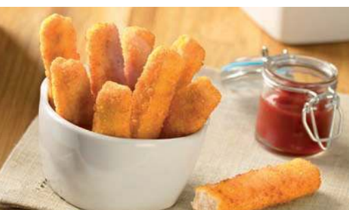
Chicken fingers :

An out of the ordinary recipe to please children and adults !