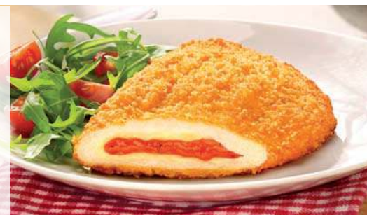
Cordon Bolognese :

A large variety of marinades for delicious recipes and perfect grilled menus.