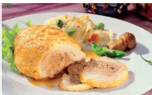
Chicken Thigh "à la forestière" :

A boneless product, with a tasty porcini stuffing. Easy to cook, delicious to eat !