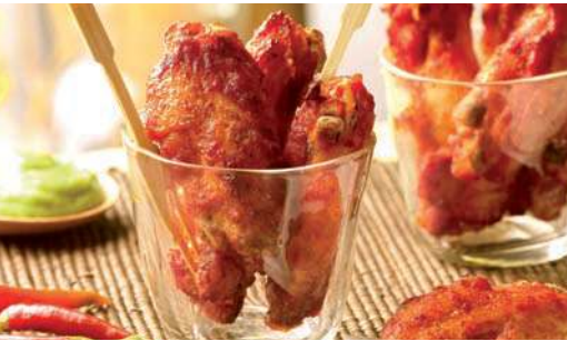
Roasted wings :

A wide range with delicious marinades. Ideal snacking product to please all of us !