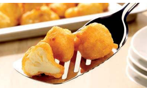
Vegetable fritters :

A boneless product, with a tasty porcini stuffing. Easy to cook, delicious to eat !