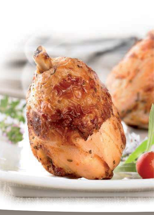
Marinated drumsticks :

Fully roasted products delicately marinated. A delicious meat just to be reheated !