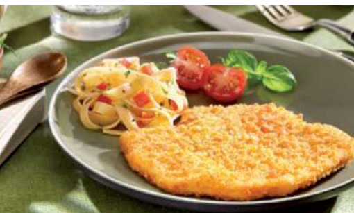
Turkey escalope "à l'italienne" :

A great item as a starter with a salad, but also as a main course.