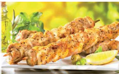
Chicken and turkey skewers :

A delicious and qualitative product, very tender meat and large plate coverage.