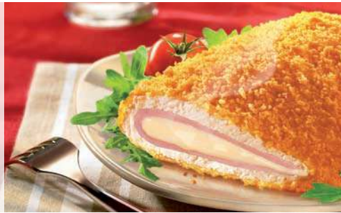
Cordon bleu :

A wide range with delicious marinades. Ideal snacking product to please all of us !